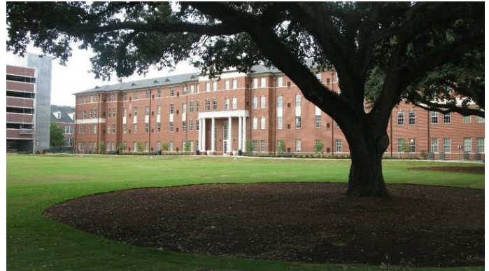
Baker Hall opened this month. It is the newest residential facility on campus.

This fall saw the opening of Baker Hall, the first of four new residence halls that are being built on campus. The new facilities will increase the student housing capacity by 37%. The second of the buildings, Huger Hall, will open in January. The remaining residential facilities will be completed by Fall 2012. To learn more about the new facilities, visit www.housing.louisiana.edu