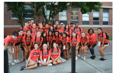
2011 SOUL Camp Staff

Encourage your son or daughter to join a club or organization today by visiting www.ulstudentlife.com .