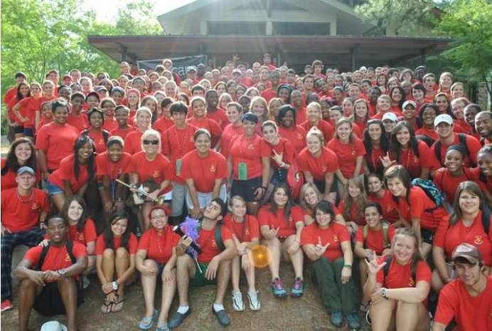
SOUL Camp 2011 Participants

SOUL Camp, Convocation, & Welcome Week help welcome students home